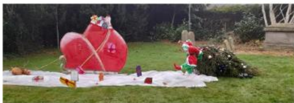
Look Out! The Grinch is Stealing Christmas!

And finally, huge thanks again to our Festival Sponsors