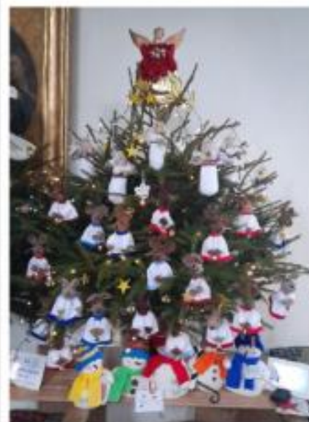
Our Winning Tree - Knitwits

3 rd Place: The Powell family of Ash Farm