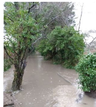
Flooded Parsonage Lane

STORMS but not in a teacup Extreme weather events are now more frequent and intense worldwide – with high financial, social, and environmental costs.