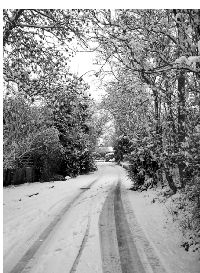
The recent storms have done lots of damage to the hedgerows in Moor Lane - more vegetation needs cutting back and the ditches clearing to help keep the culverts in Main Street clear