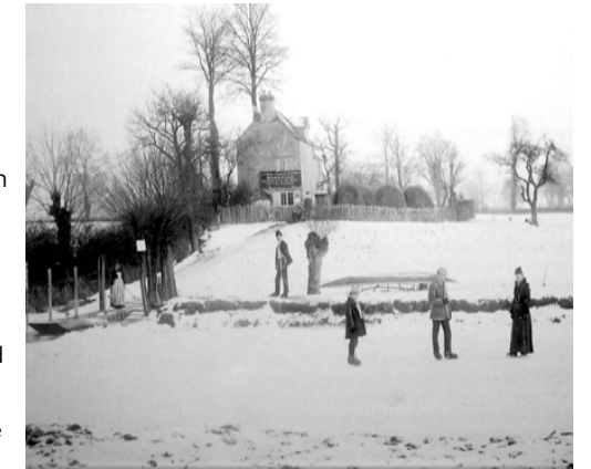
skating on the frozen Thames at Marston Ferry

Ashmole is of course commemorated in the Ashmolean Museum in Oxford which he founded in 1682 with his very old friend John Tradescant.