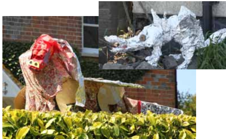
These and lots of other photos mainly by Roger Sweet can be found on the website