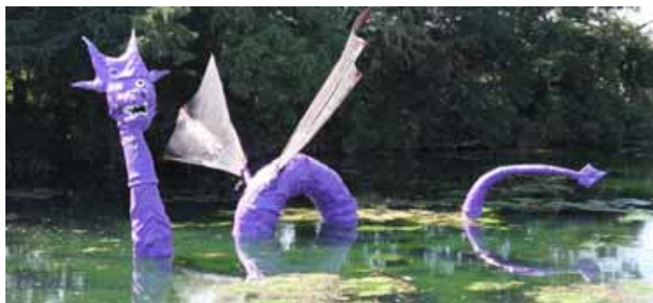
The Dragon returned to the pond - more inside