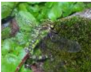
Southern Hawker Dragonfly laying eggs