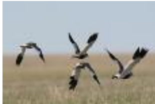
Lapwings in flight