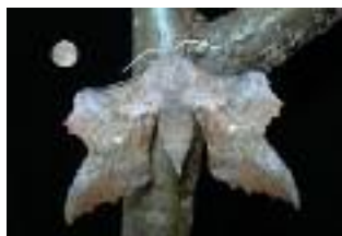
Poplar Hawk by moonlight

In addition probably most of us have now heard about central