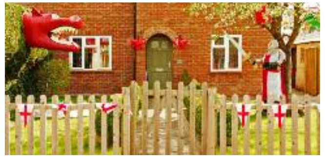
First prize: 5 Manor Close

Thanks to everyone who supported the St George's Day events.