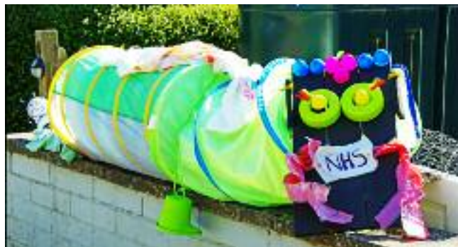
The Children's Prize went to 6 York Road