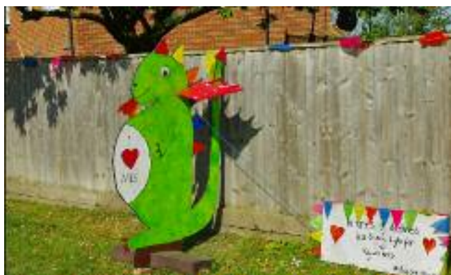
Runner up: Ash Farm, York Road