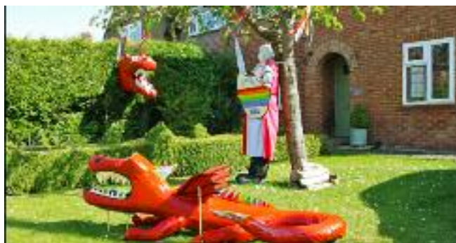
Overall winner: 5 Manor Close