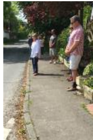
Villagers observing the two minute silence on Friday 8th May

A small group of villagers met at the bus shelter, the village War Memorial, to observe the two-minute silence together and remember those from the village who had died in the two wars.