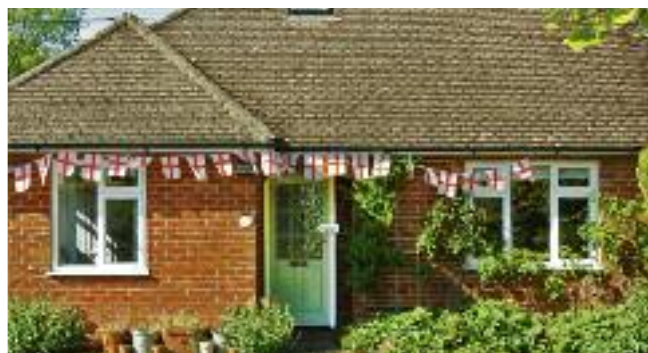
VE celebrations in York Road and Manor Close