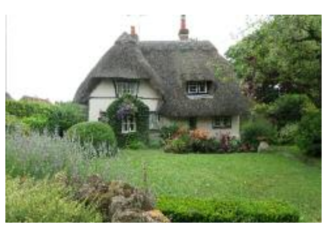
Green Thatch, Main Street