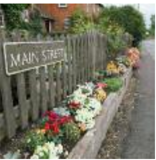
1 Main Street

If you wish to get in touch with the Village Association, please email: