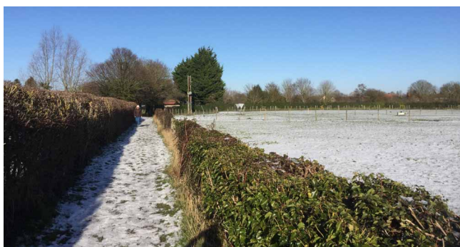
A snowy scene in January