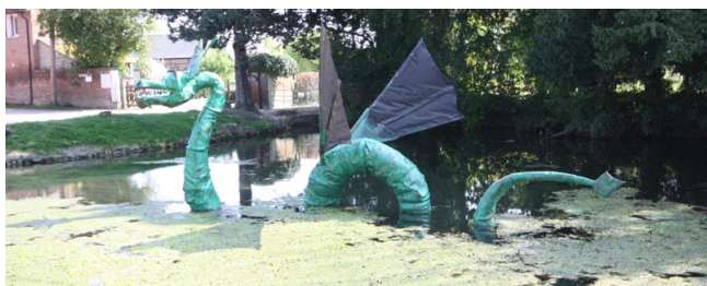
The original dragon in the pond from 2009