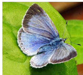
Female Holly Blue

I have seen few butterflies in the garden, mainly orange tips and