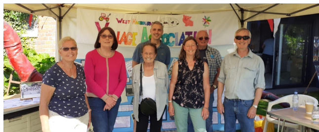
Members of the Village Association

This year's St Andrew's Christmas tree festival runs from 10th - 18th December. Following on from the success of last year, there will be the opportunity for residents in East & West Hagbourne to display 4ft trees in their front gardens,