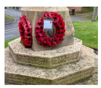
A poppy wreath from the village was laid on the East Hagbourne Memorial Cross