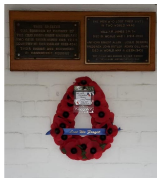
Remembrance Day poppy wreath displayed in the bus shelter in West Hagbourne

The next village walk will take place on Sunday 16th January at 1:30pm starting from The Square. This will be a short walk along local paths finishing in the barn at Chapel Hayes for warming refreshments of mince