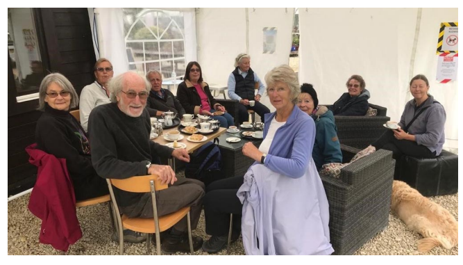
Enjoying tea and cake at the Style Acre cafe after the autumn village walk

Thanks to everyone in the village who signed up for a garden tree in support of this year's fundraising event. As I write, an amazing 28 trees will be brightening our village with their twinkling lights during the