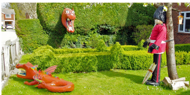
Second prize: 5 Manor Close