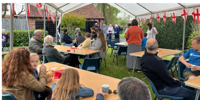
Dragon teas at Woodleys