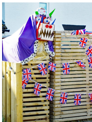
Children's prize: 6 York Road