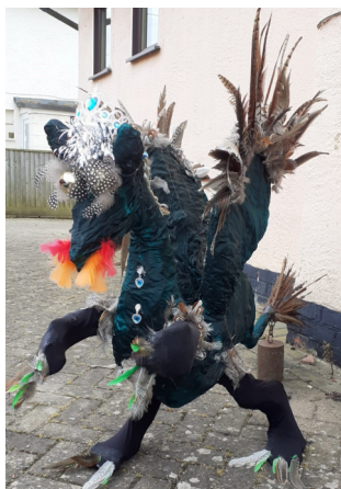
First prize: 9 York Road