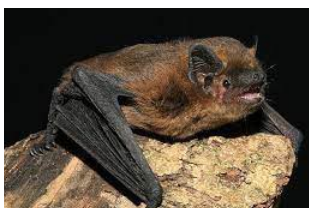
Common Pipistrelle bat