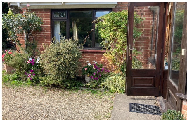
12 Manor Close