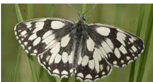
Marbled white butterfly

and nectar gathered by the parents in September, before pupating and then tunnelling out in early September the next year. They are easy to spot on a warm, sunny afternoon, as they tend to fly in large numbers (many hundreds!) close to the ground.