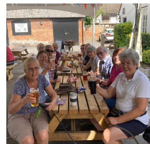
R & R at the Fleur de Lys