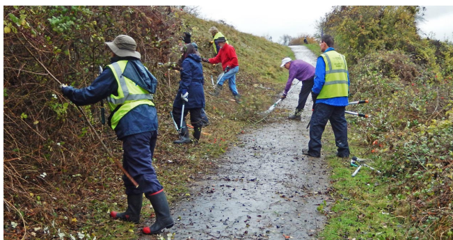
Volunteers working on the ramp