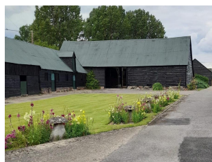
York Farm, York Road