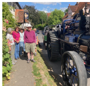
Steam engine, East Hagbourne