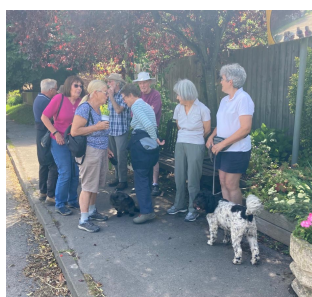
Intrepid walkers at the bus stop

The summer village walk took place on the 9th July this year. Eleven villagers headed north along the footpath at the end of York Road, past the vineyards to the outskirts of Didcot. We turned right, crossed Park Road and continued along the back of Loyd Road, through Mowbray Fields, along Butts Piece and Croft Road to the Fleur de Lys. After a timely libation, we followed School Lane back to West Hagbourne.