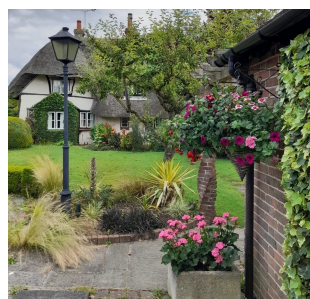
Green Thatch, Main Street

side and a neat parterre within sight from the gate"