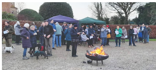
Carols in the farmyard