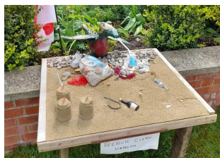
Adult winner: Tall Trees