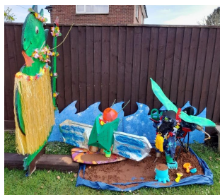
Child winner: 6 York Road