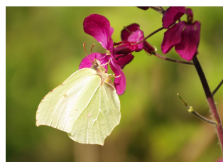
Brimstone on Honesty

the bird feeders (perhaps we should call them squirrel feeders!). Other recent visitors are a Heron, seen on two occasions, and rabbits, which are becoming a serious problem in the north west corner of the village. Their favourite food in my garden is Day Lilies (Hemerocallis) when the shoots are 3-5 cm in height.