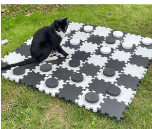
Cat enjoying a game of draughts

and Garden Chequers – this attracted an unexpected competitor, but our policy is "everyone is welcome" and after all, he dressed for the game (see photo).