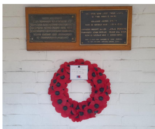
New poppy wreath

November. A two minute silence was observed and a new poppy wreath hung as a mark of respect to those villagers who lost their lives during WWI and WWII.