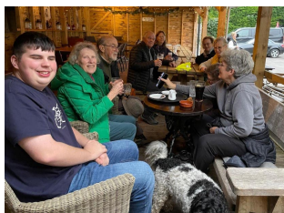
Welcome drink at the Fleur

A well-attended service was held at the West Hagbourne War Memorial on the 10th