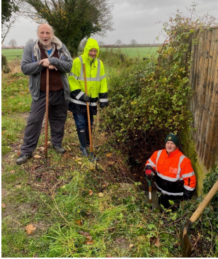
Flood control work underway at the end of York Road at the junction with Manor Close