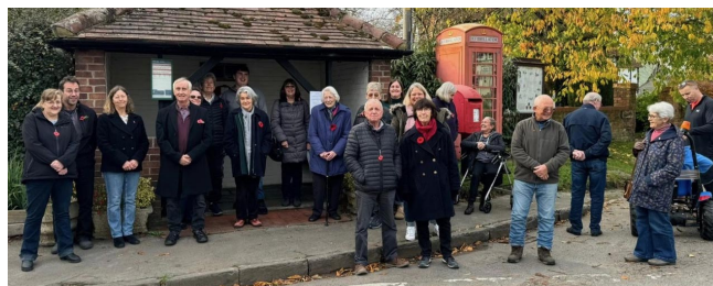
Villagers observing a 2 minute silence

The Village Association has sponsored a tree for the middle of the village again this year. It will stand under the horse chestnut tree in The Square. We would like to invite the children/grandchildren of the village to come along between 11am-12pm on the 7th December to help decorate the tree. Why not make some decorations? Last year we had some very beautiful origami, the