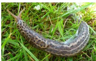
Leopard slug

Pick off slugs off plants in the evening and put them in your compost heap.