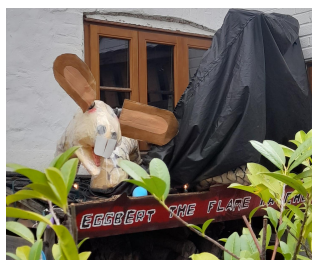
First prize: Broomsticks

Good News! The date for our village barn dance is fixed for Saturday 5th July 2025 from 7-