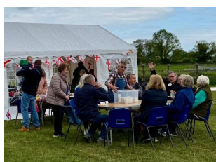
VE Day celebrations

11pm. The venue is the Grain Store, Reading Road, West Hagbourne. OX11 0FE (thanks to Jeff Powell). Live music will be provided by Pandemonium from Wantage.