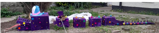
Children's prize: 8 York Road