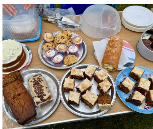
Cakes at Woodleys

We will be undertaking a leaflet drop in a few weeks for you to fill in details about numbers and dietary requirements.