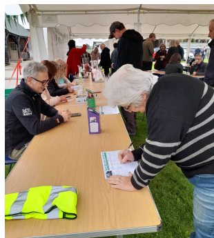
Macmillan Coffee Morning: donations and plenty of cake