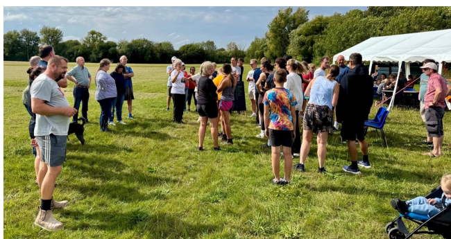
Rounders: post match celebrations